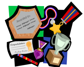
Recognize a volunteer!

Our Mission is to serve Veterans and their dependants, promote remembrance and act in the service of Canada and its communities.